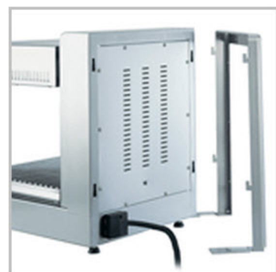
Wall mounted support optional