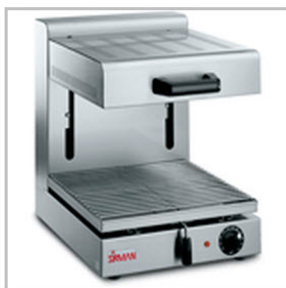
PRO 1/2 G