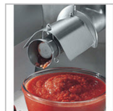
Optional tomato sauce making