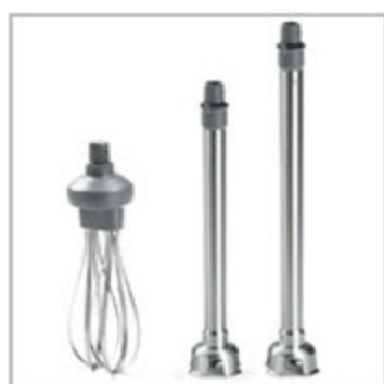
Shafts and Whisk