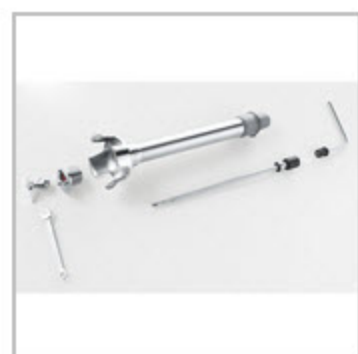
Removable knives and shaft