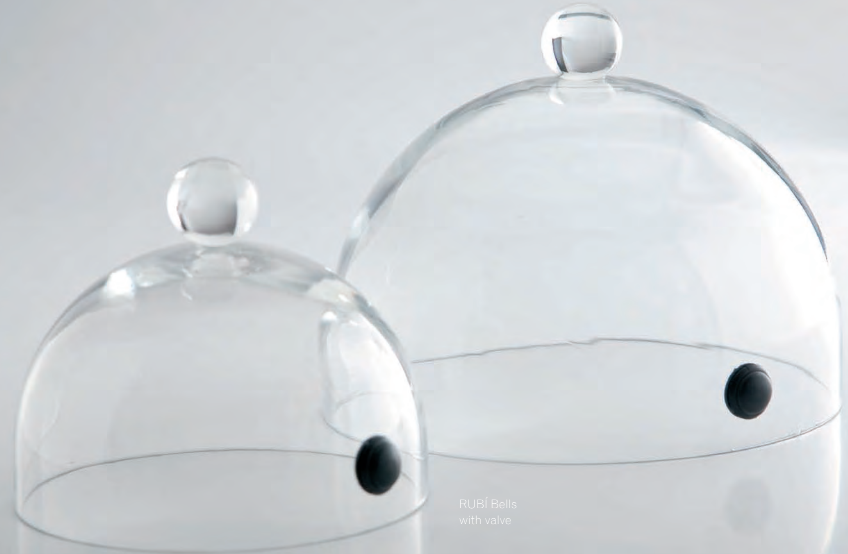
RUBÍ Bells with valve